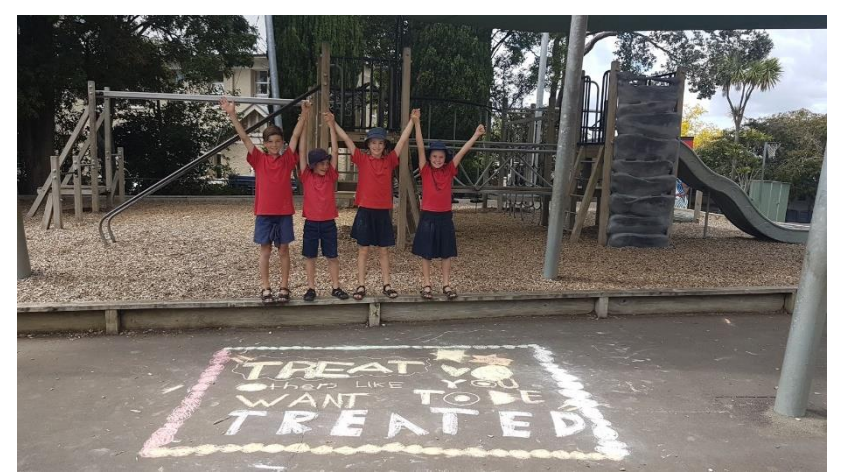
Working as TEAM to produce motivational quotes.